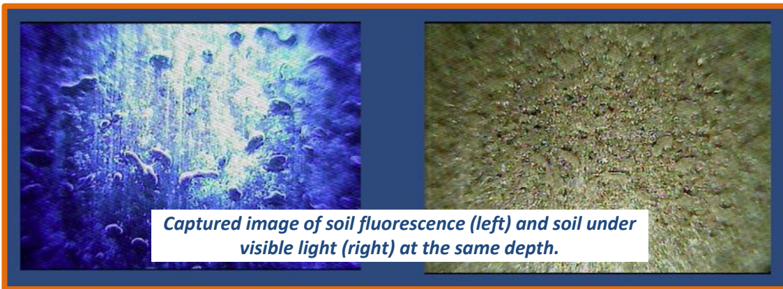
Captured image of soil fluorescence (left) and soil under visible light (right) at the same depth.