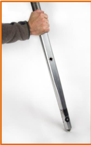
OIP probe with sapphire window on side of probe.

The Latest Addition to the High Resolution Site Characterization Tool Box.